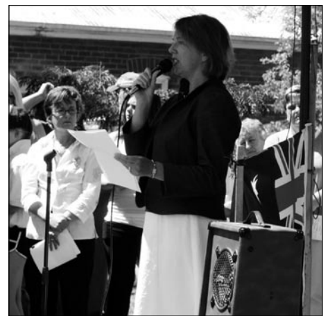
Catherine King MP