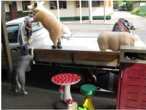
Carnival of the Animals